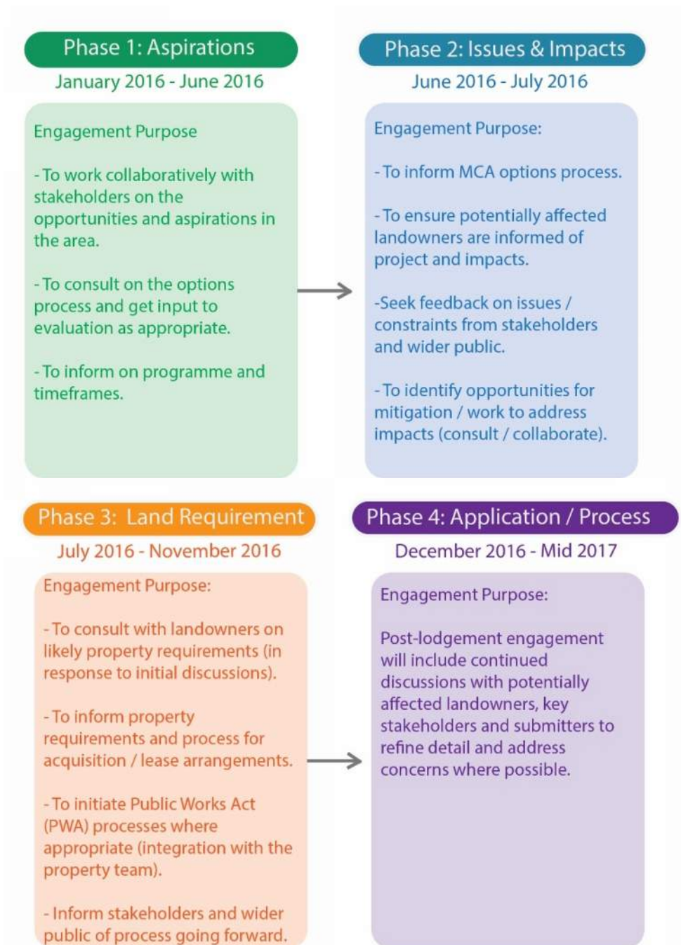
Figure 9-3: 2016 Engagement in Project development phase