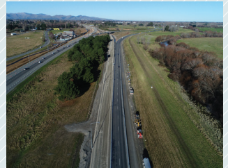
Widening of SH1 between the Waimakariri Bridge and the CNC motorway.

Thank you for your understanding and cooperation.