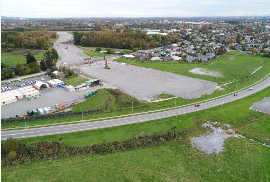
Left: Winters Road/QEII Drive site from the air. Below: Photos from our Community Open Day on March 28.