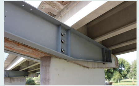
Installation of the steel headstocks underneath the Waimakariri bridge to strengthen the piers.