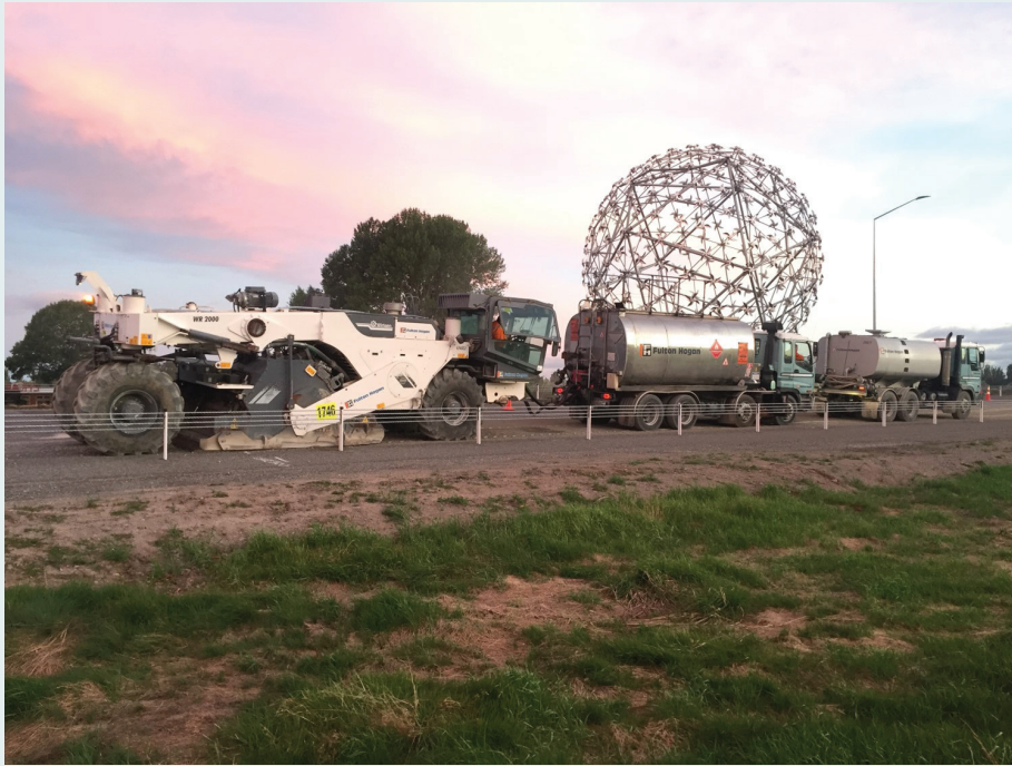
Our foam bitumen stabilisation on SH1 in early January this year.