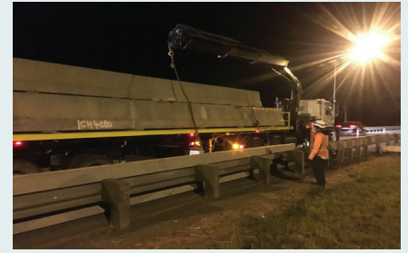
Safety barrier installation at night.