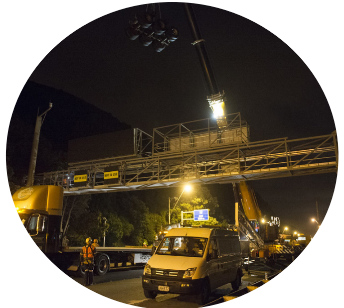
INSTALLING GANTRIES THIS SIZE WILL REQUIRE A FULL MOTORWAY CLOSURE FOR ONE NIGHT ON WEDNESDAY 30 SEPTEMBER.

The motorway will be closed between Groynes Drive and Tram Road, all traffic will be diverted over the old Waimakariri Bridge (Main North Road) from Ohoka and Groynes.