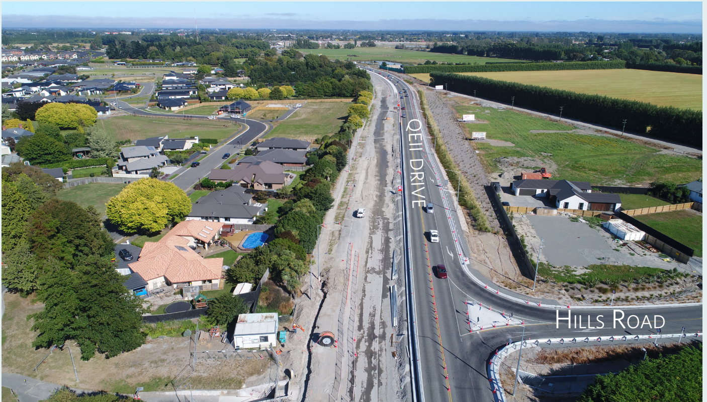
Work is in full swing upgrading the existing westbound lanes on QEII Drive.