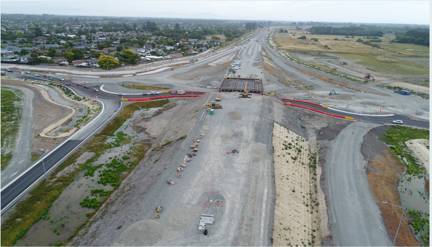
Southern Interchange: the new motorway will go over QEII Drive on a bridge. Access to and from QEII Drive and the new motorway will be provided by double roundabouts.