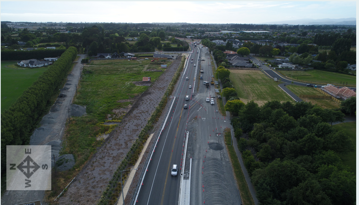
TWO WAY TRAFFIC ON QEII DRIVE NEAR THE INNES ROAD ROUNDABOUT HAS BEEN MOVED ONTO THE NEW EASTBOUND LANES SO WE CAN WORK ON THE REMAINING WESTBOUND LANES TO UPGRADE.