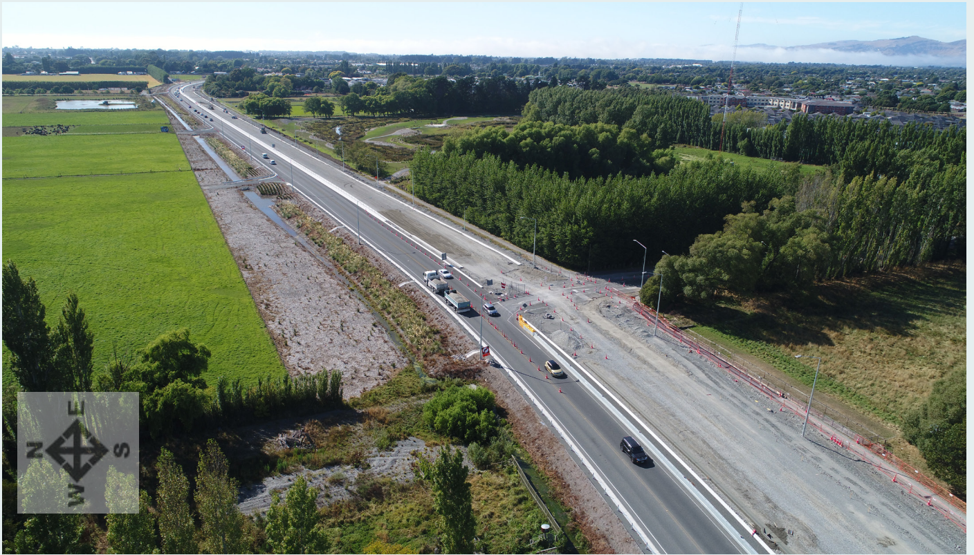
WORK ON NEW QEII DRIVE WESTBOUND LANES IS PROGRESSING WELL, WE WERE ABLE TO COMPLETE THE WORK ON PHILPOTTS ROAD JUST BEFORE THE LEVEL 4 LOCK DOWN, FROM 25 MARCH PHILPOTTS ROAD WAS OPEN AGAIN FOR LEFT OUT ONLY ONTO QEII DRIVE.