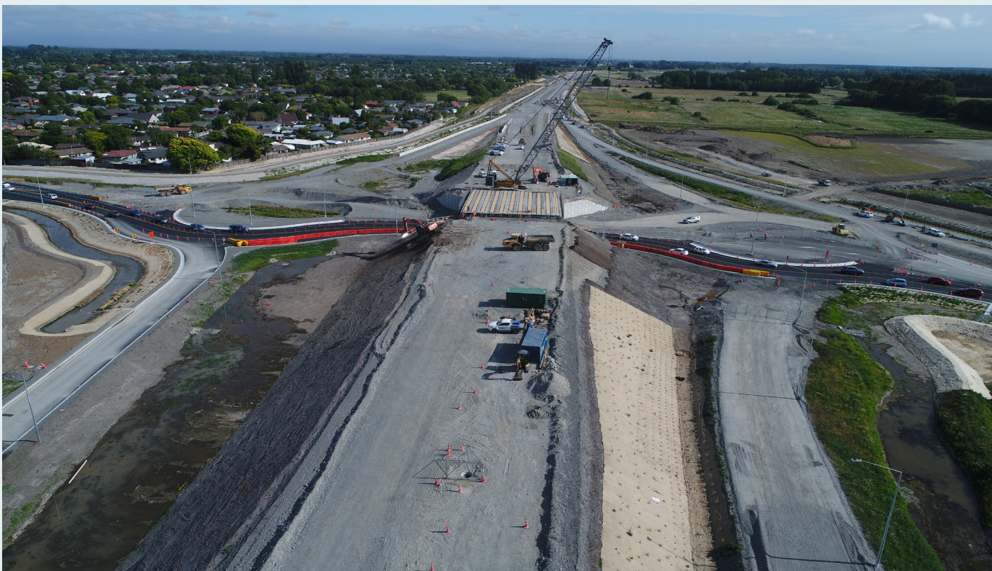
Southern Interchange: the new motorway will go over QEII Drive on a bridge. Access to and from QEII Drive and the new motorway will be provided by double roundabouts.