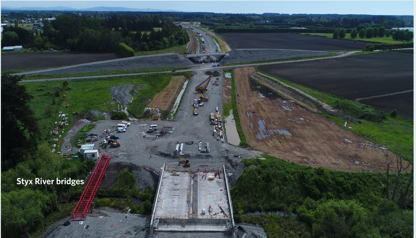
Styx River bridges

We recently lifted the deck into place for the separate pedestrian bridge over the Styx River(left in the photo). In the background is the Radcliffe Road bridge taking shape.