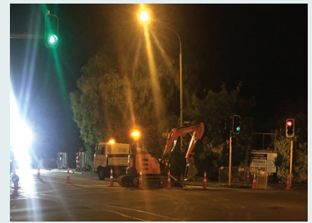
Working at night means the crew need lights to see what they are working on.