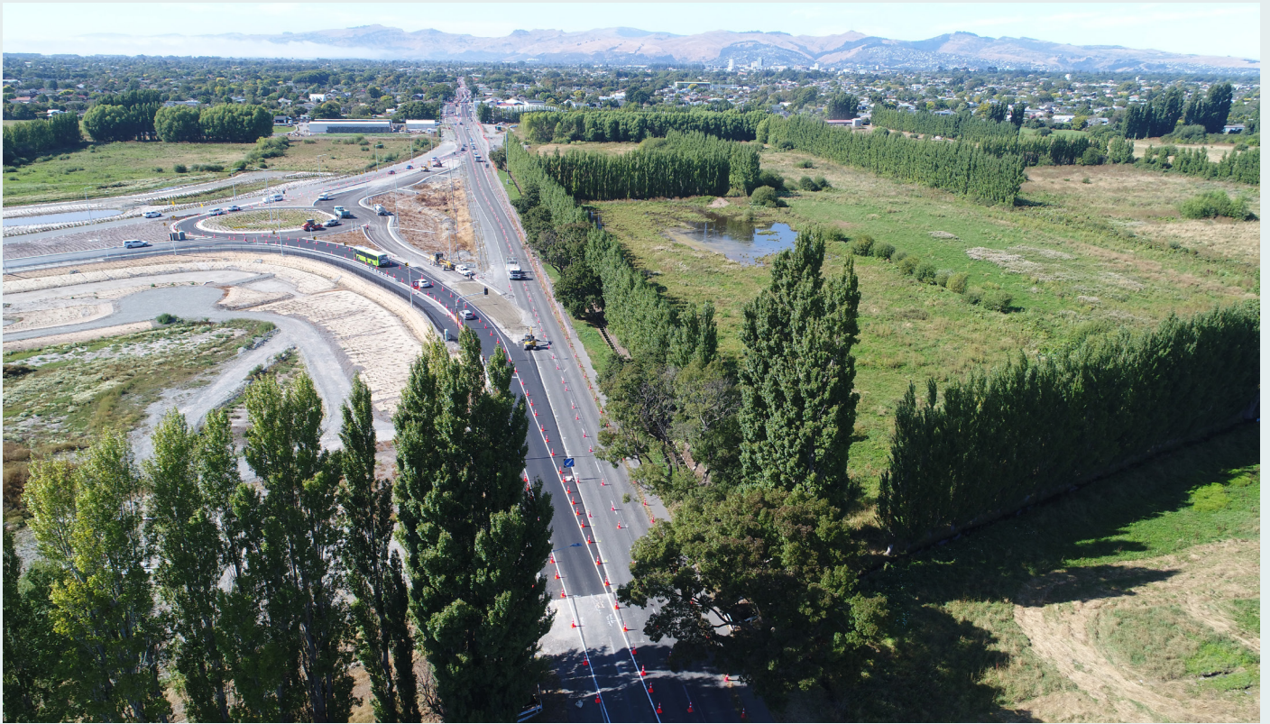
Two way traffic on Cranford Street is now using part of the new roundabout. In our video section on the website: www.nzta.govt.nz/cnc there is an animation showing how the roundabout will provide easy access to and from the new CNC motorway.