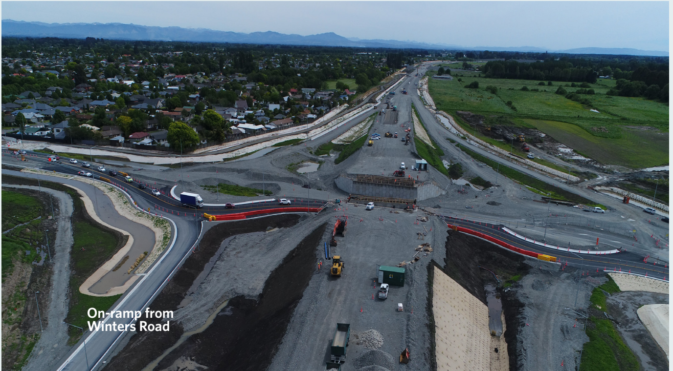
In 2020 when the motorway is complete, residents in the Winters Road area will have easy access, left in from Cranford Street and left out to QEII Drive and the new CNC.