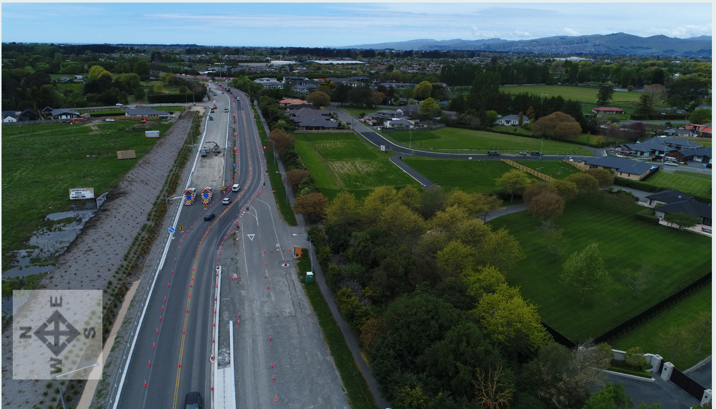
TWO WAY TRAFFIC ON QEII DRIVE NEAR THE INNES ROAD ROUNDABOUT WILL BE MOVED ONTO THE NEW EASTBOUND LANES SO WE CAN WORK ON THE REMAINING WESTBOUND LANES TO UPGRADE.