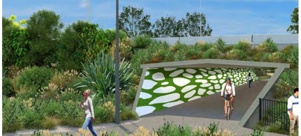
Urban design and landscaping subway Winters Road (for illustration purposes only)

A shared pedestrian and cycle path will run almost the entire length of the Christchurch Northern Corridor, from Empire Road to Cranford Street.