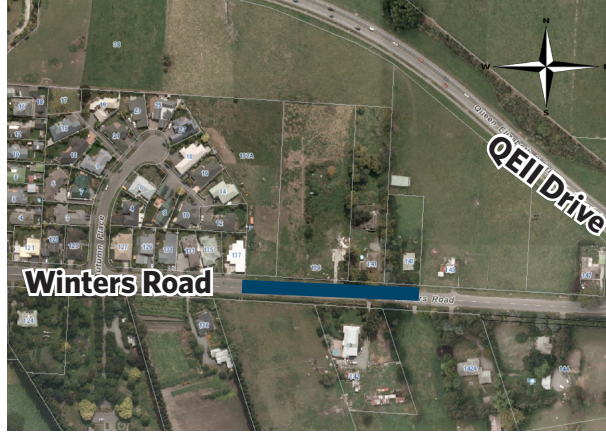
Figure 1 the blue line shows the area of the road closure on Winters Road between 137 and 143. Traffic east on Winters Road can enter and exit from QEII Drive. Traffic west can enter from Main North Road or via Cranford Street and Fraser Street, exit only via Fraser Street/Cranford Street.