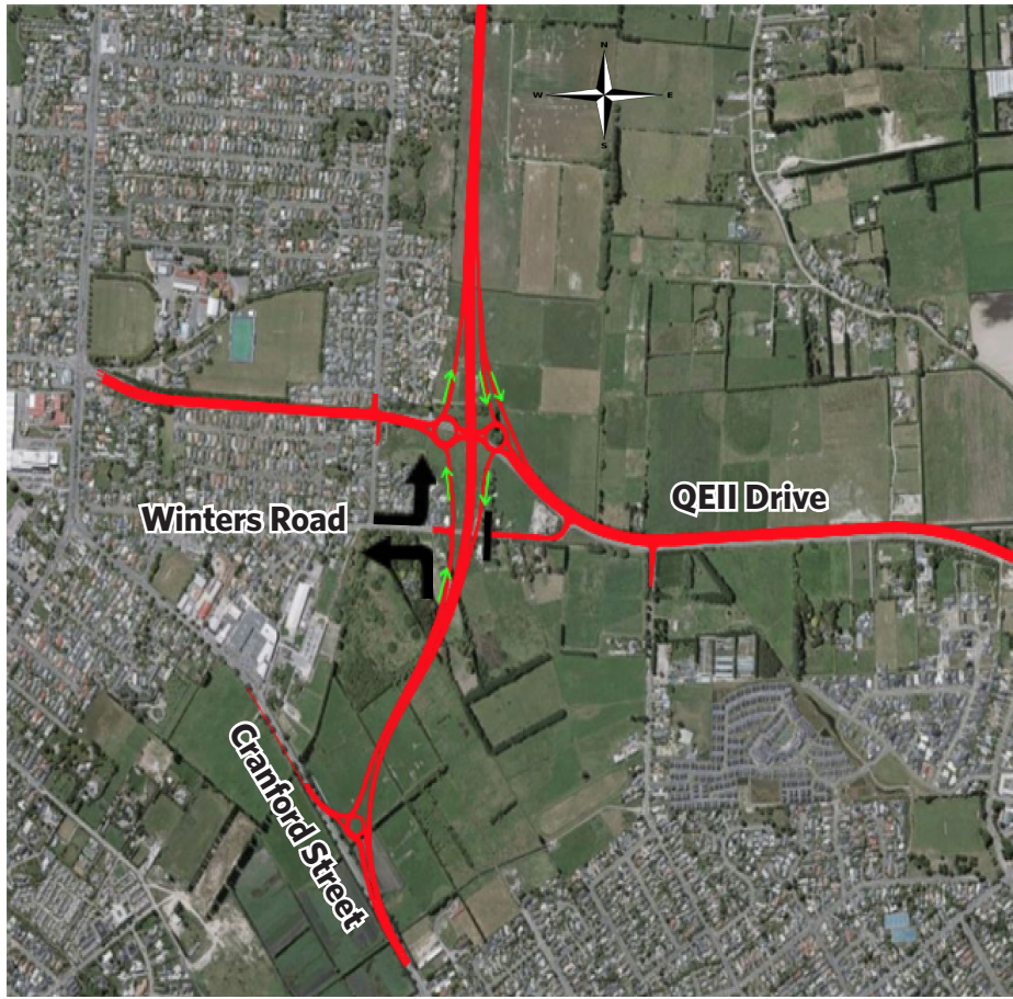
Figure 4 The red lines on the map illustrate the QEII Drive upgrade to four lanes and two new roundabouts, the new motorway, the new roundabout near Cranford Street and access to Winters Road from and onto the new motorway and QEII Drive.