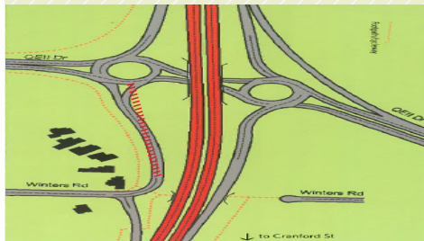
Figure 3 concept drawing 2011 showing two way section Winters Road with QEII Drive. The one section marked in red hashes has now been removed from the final design plans.

See Figure 4 on the back page for details.