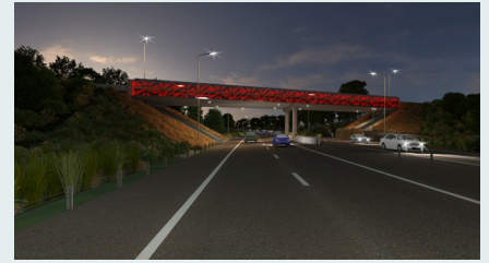
Artist's impression of the Radcliffe Road Bridge.