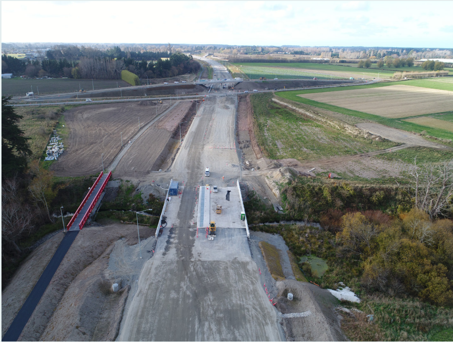
The Styx River Motorway Bridge with the separate pedestrians and cyclists bridge, in the background the Radcliffe Road Bridge in construction.