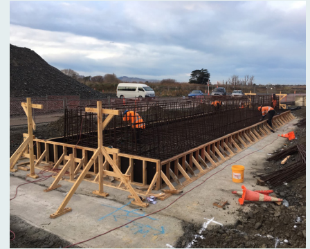
Looking back: centre pier Radcliffe Road Bridge in construction.