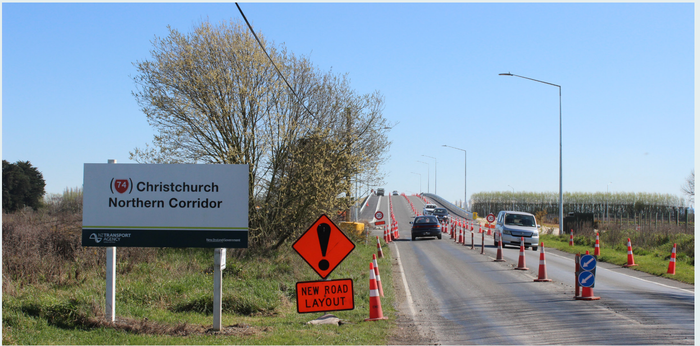
Radcliffe Road Bridge opened to two way traffic on Thursday 3 September.