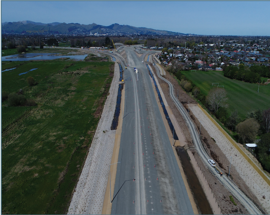
Looking south from Prestons Road towards QEII Drive. Work on the motorway alignment, the shared use path and landscaping is progressing well.