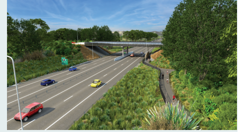
Artist's impression of the Prestons Road Bridge.