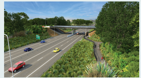
Artist's impression of the Prestons Road Bridge.