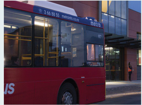
Access to public transport.