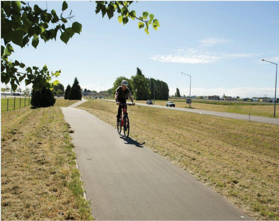
From the new Cranford Street roundabout the new CNC shared path will link to the Council's cycleway Papanui Parallel-Rutland Street.