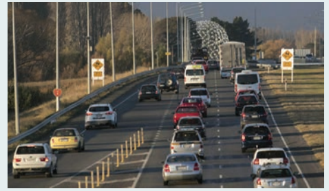
Reduced congestion and reduced commuter travel time.