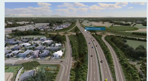
Artist's impression of the motorway going over QEI Drive. On the left, left-in and left-out access to Winters Road is visible.