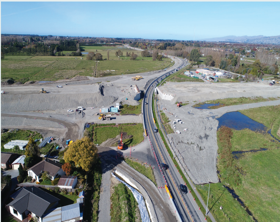
Work on the QEI Drive Bridge is progressing well. The new motorway will go over the QEI Drive interchange; two new roundabouts connecting east and west QEI Drive will provide access on and off the CNC motorway.