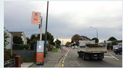
At times we will have to move the bus stop; a temporary bus stop will be set up. No-parking cones and signs will indicate the temporary bus stop area.

The left turning lanes on the Cranford Street and Innes Road intersection will temporarily shift to enable us to excavate and install cables underground. The footpath at the north-west corner will be temporarily closed.