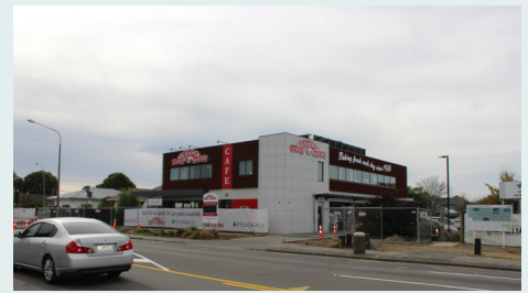
The right turn from Cranford Street into the bakery/pharmacy parking lot is blocked during the cable works. Please turn left from Cranford Street or use the Innes Road entry.