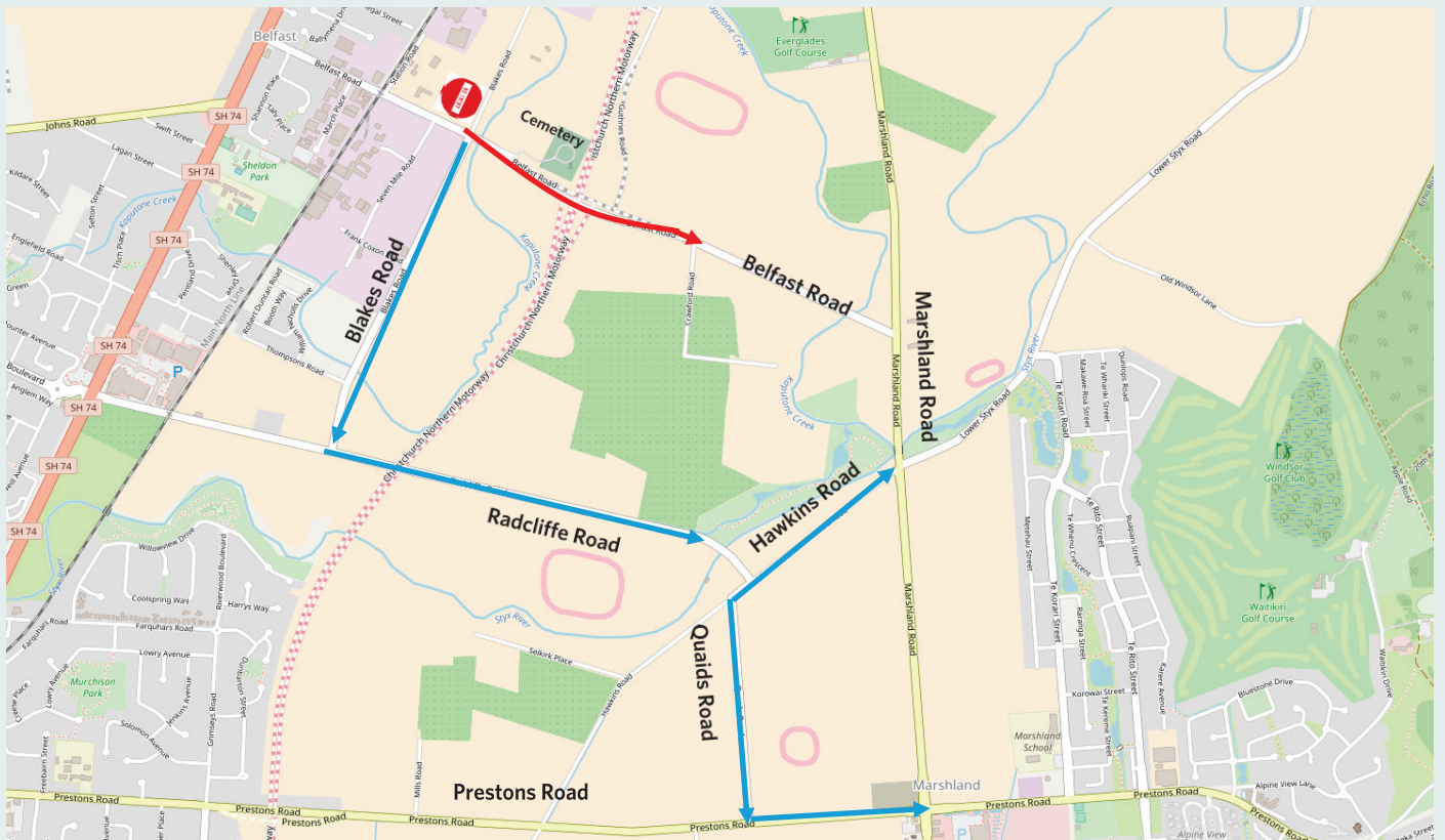
Blue lines on the map show the alternatives to the eastbound lane closure (red line on the map) on Belfast Road between Blakes Road and Crawford Road.