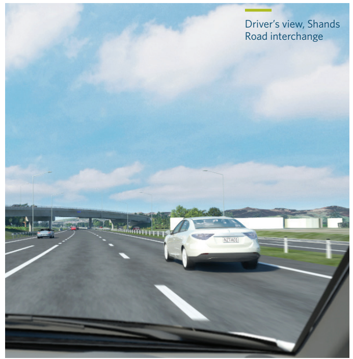
Driver's view, Shands Road interchange