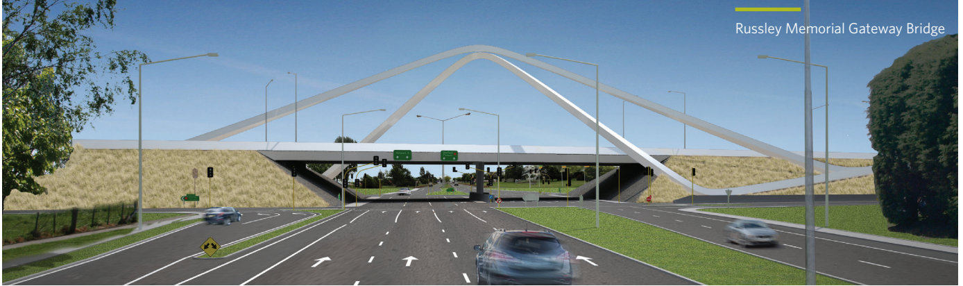
Russley Memorial Gateway Bridge