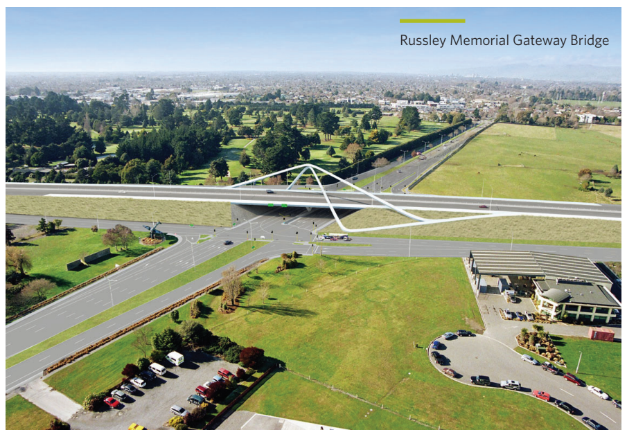
Russley Memorial Gateway Bridge

The government's investment in this project will not only increase the capacity of roads to handle increasing freight traffic, but will improve safety for all road users. In addition it will provide an injection of government money into the local construction industry, providing employment and other benefits for our region. By improving our roads, we are supporting the rebuild and improving our future.