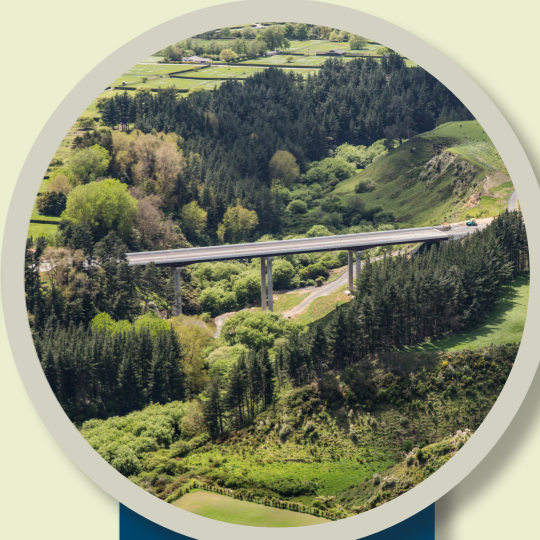
Karapiro Gully viaduct