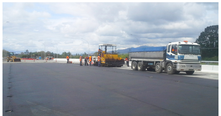
Top: Victoria Road interchange traffic signals. Bottom: Southern interchange bridge having the OGPA laid.

Traffic management will be needed to do this work and some delays and lane closures will be required. These will be advertised well in advance.