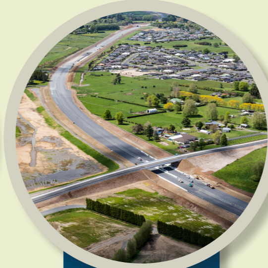
Swayne Road bridge