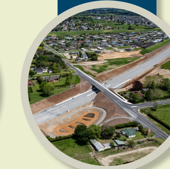
Thornton Road bridge