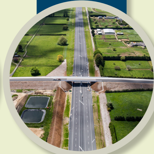
Peake Road bridge