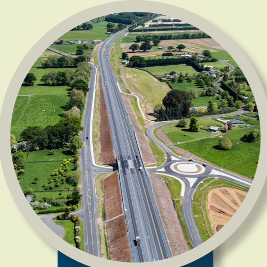
Pickering Road bridge