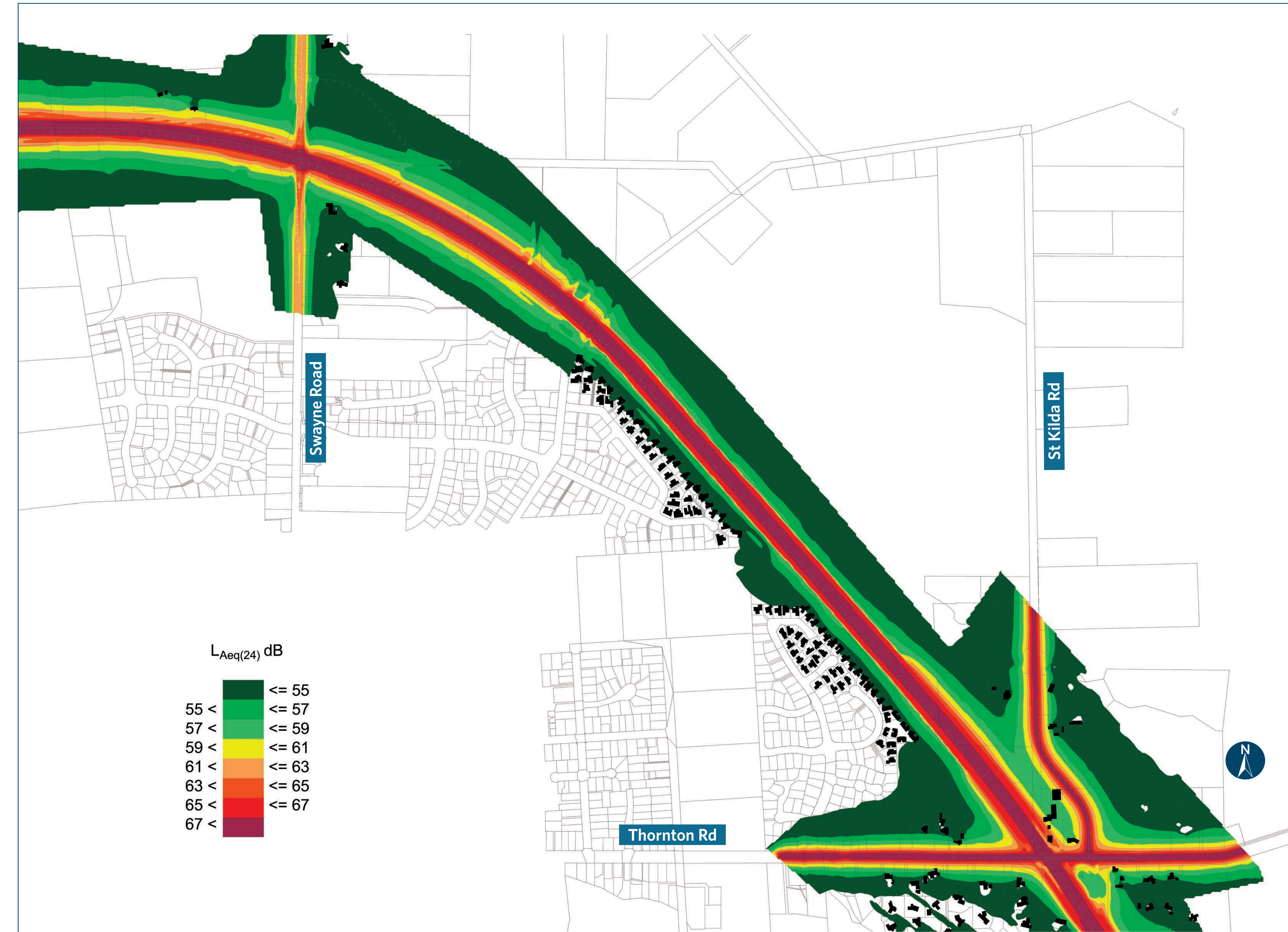
Construction design noise model

The model settings used for these contours are set out in the Noise Mitigation Plan dated 15 May 2012.