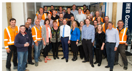
Top: Members of the project team meet Prime Minister John Key. Bottom: Prime Minister John Key and MP Louise Upston at the Visitor Centre.

The project team were proud to show him around the site office at Victoria Road and give him an update on the project, which is tracking well ahead of schedule. Half of the bridges on the project are now complete and the project team can see the finish line looming, possibly before the end of the year, depending on how the winter season goes.