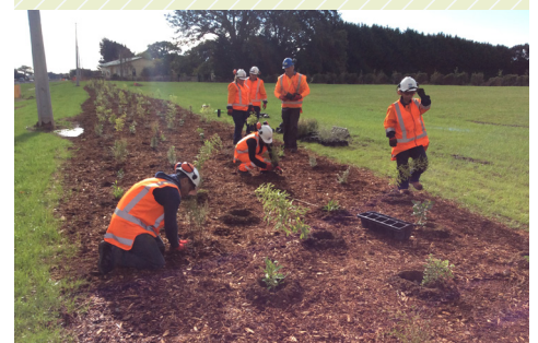
The landscaping team planting at the northern end of the project.

Planting of the new interchange will include a mixture of natives and Oaks. Holes will be pre-dug and plants will be provided for those who would like to take part.