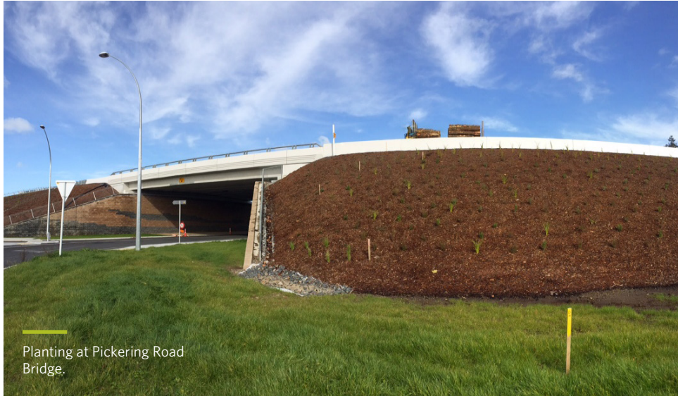
Planting at Pickering Road Bridge.