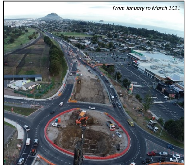
From January to March 2021

While there will be minor traffic switches in the Bayfair area in future, SH2/Maunganui Road traffic will remain on the Matapihi and Bayfair verges until the Bayfair flyover is opened to motorists at project completion. Future traffic switches are also planned at the project's Te Maunga end, including when the southern interchange opens to motorists next year.