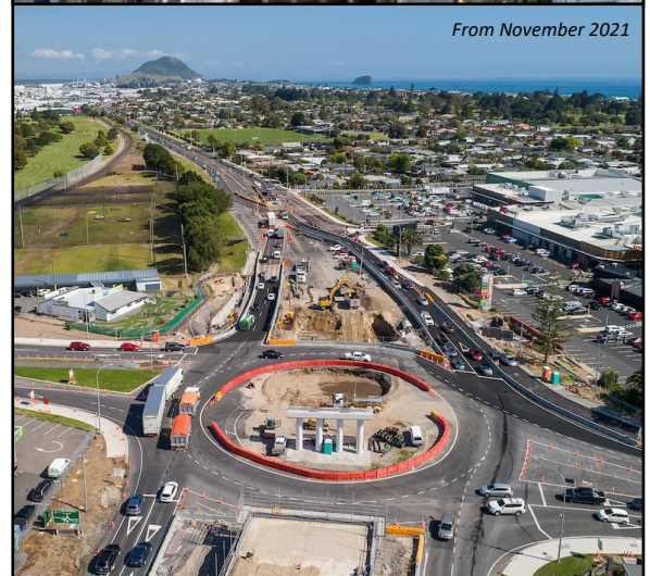
From November 2021