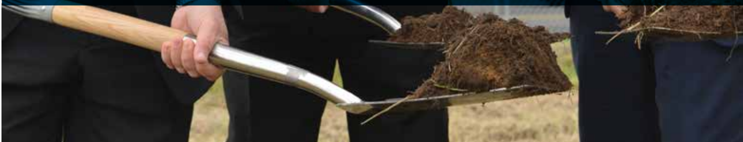
L-R: Tauranga City Council Mayor Brownless, Hapu representative Wiremu Hiamoe (Ngati Tapu), Minister of Transport Hon Simon Bridges.

Stage One, the enabling works and the relocation of the East Coast Main Trunk Line railway line, was completed in December 2016. The new rail crossing on Mataphi Road is now past the Owens Place retail park and no longer directly impacts the flow at the Bayfair roundabout. Trains started running on the new railway line in November 2016.