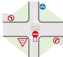
Partial Closure (Out Only)

• As mentioned previously, some new traffic filtering guidance is being prepared to help RCAs to implement the recent “Reshaping Streets” legislation (aka the Streets Layouts Rule). Draft content was presented to AMIG for their feedback; it covers details about legislative context, delivery approaches, network planning considerations, treatment options, and design features to use (including signs, markings, traffic calming devices, and street amenity features). An interesting by-product of this guidance is the potential to introduce some new signs in NZ covering various vehicle prohibition and exemptions situations not currently captured here.