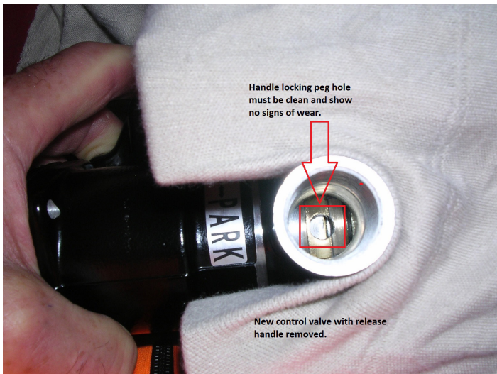
Locking peg hole