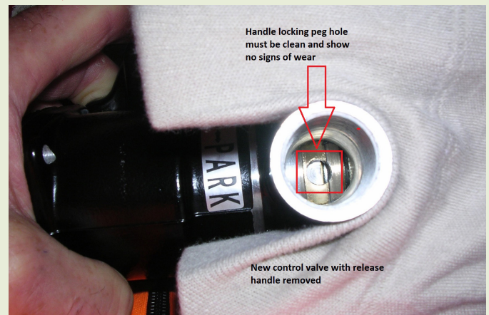
Locking peg hole

The areas that require a close inspection if you are looking to repair this valve are in the illustrations below (new valve shown).