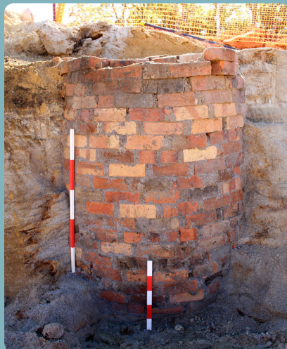
Top: This archaeological dig uncovered an early food storage pit with evidence of a post hole.