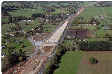
At the northern end of the job: embankments, Pickering Road pond and the roundabout have come a long way in the last few months.

"I think they really 'get' what we are doing here and what will be achieved. All the project partners want to thank them for their patience and support."