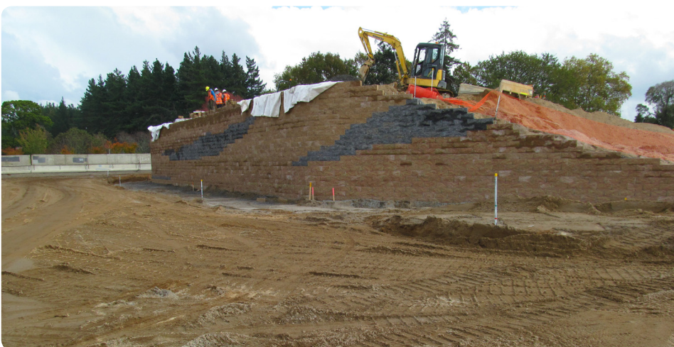
Progress on the bridge abutment walls for the Pickering Road Underbridge has been steady and the earthy tones are starting to come together.