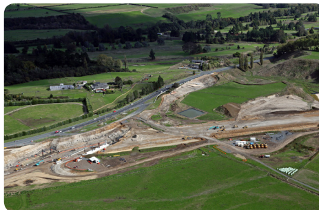
Progress at the southern end of the job: - work on the foundations for the southern Interchange bridge is progressing rapidly.