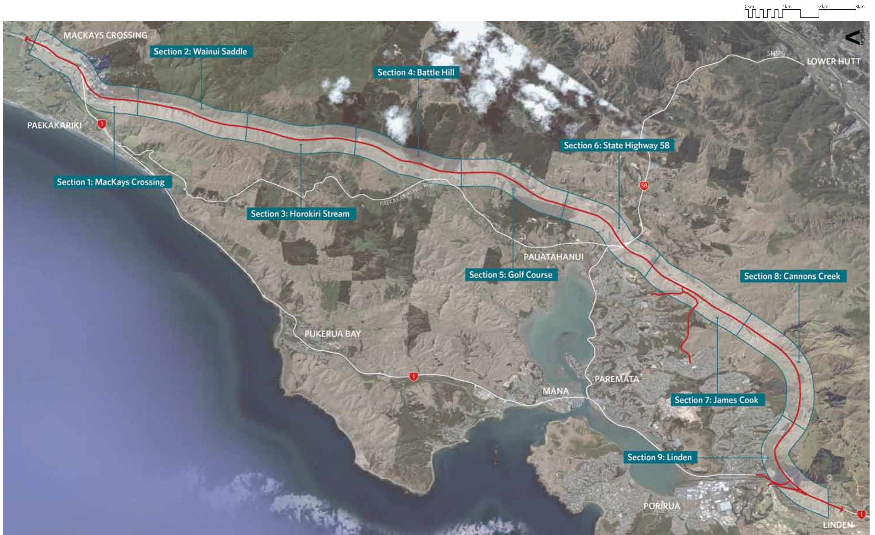
Figure 1.4: Transmission Gully Project Sections