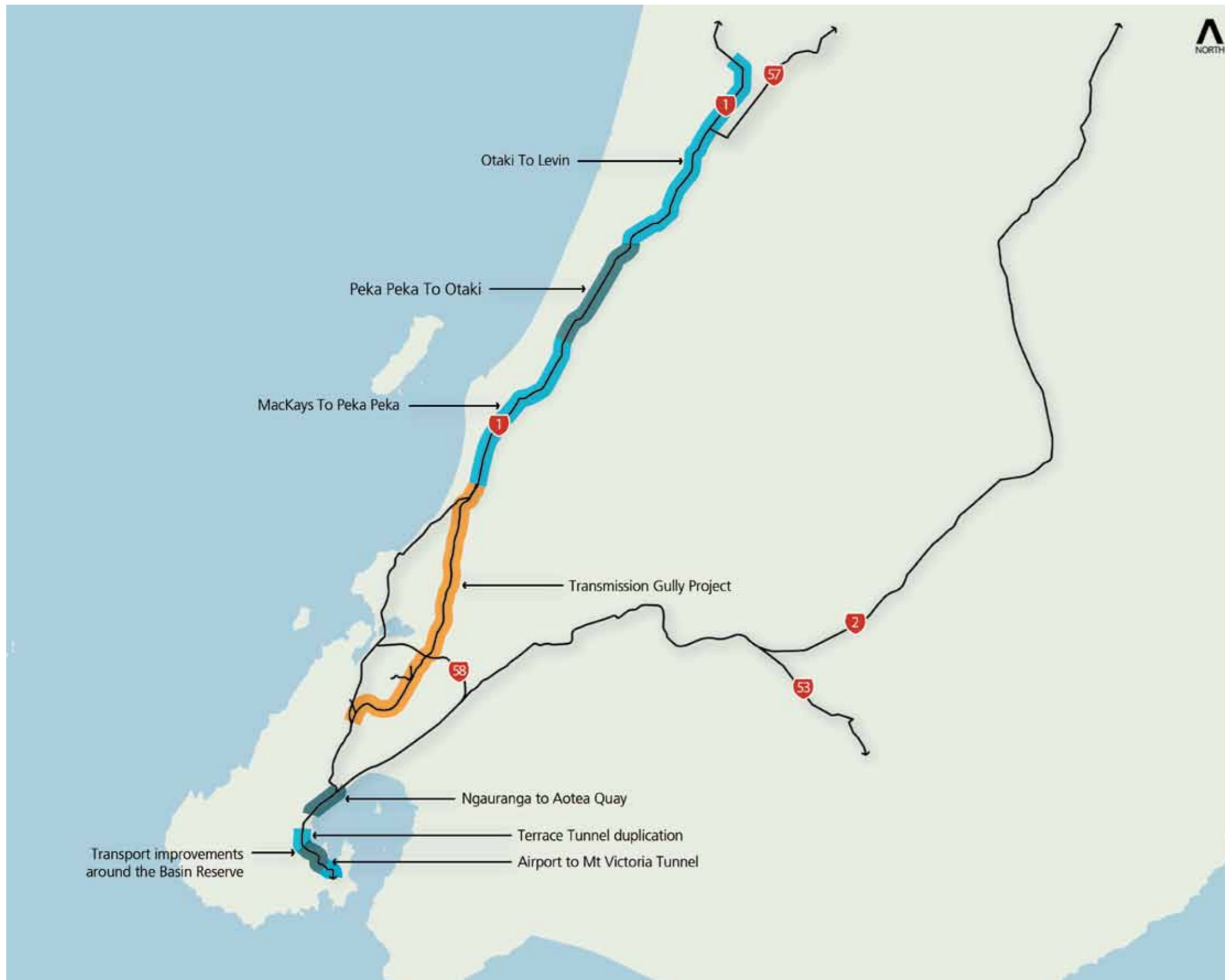
Figure 1.1: Wider Context: The Wellington Northern Corridor Road of National Significance