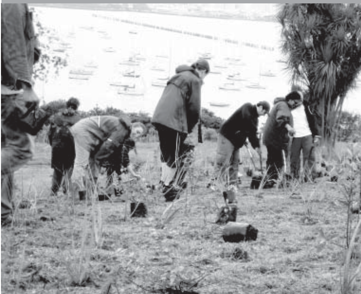
2 Mountainview School, Manakau City.