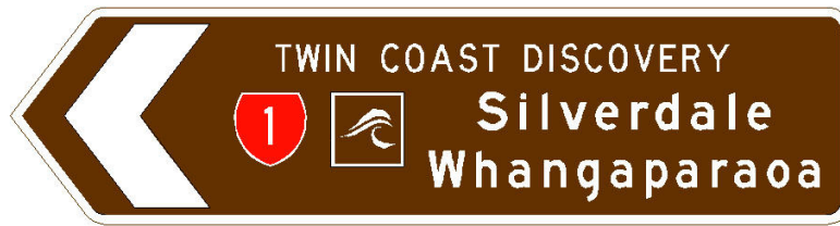
ID - 3