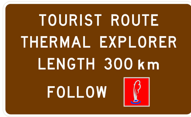
TR - 6