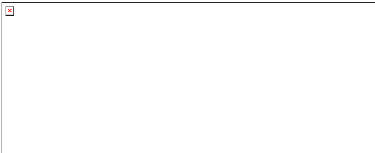
Figure 1: Key Components of a Safety Management System

Figure 1 below outlines the relationship that the Safety Management System and the Road Safety Strategy has to the key components.