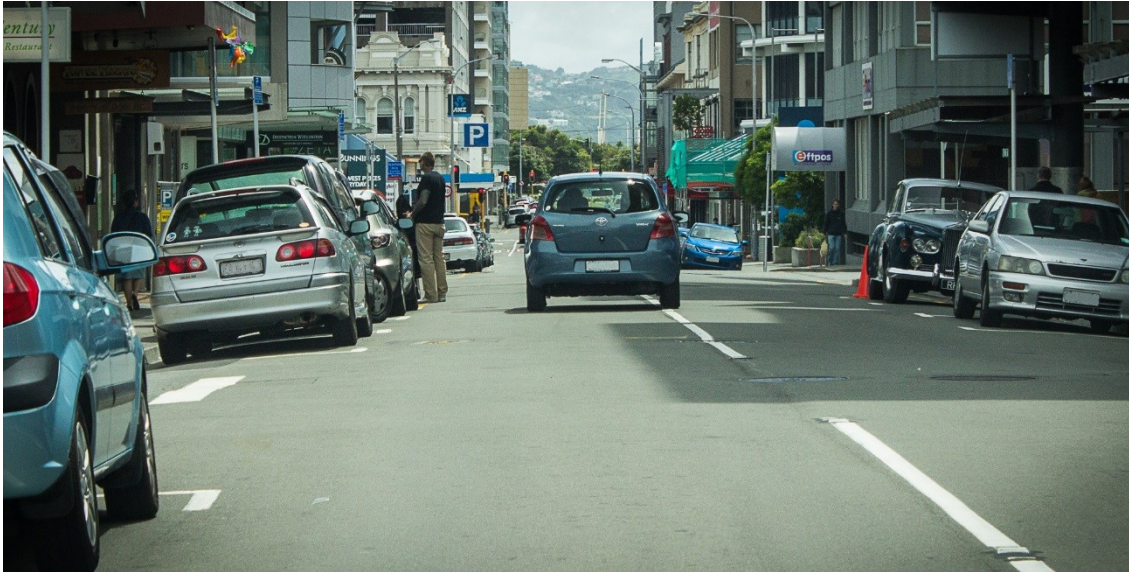
Figure 3.1 View of Tory Street road layout, Wellington

been shown to reduce the efficiency of transport networks. Approximately 30% of inner city traffic is estimated to be the direct result of drivers 'cruising for parks', although the effect varies between streets (Shoup 2007).