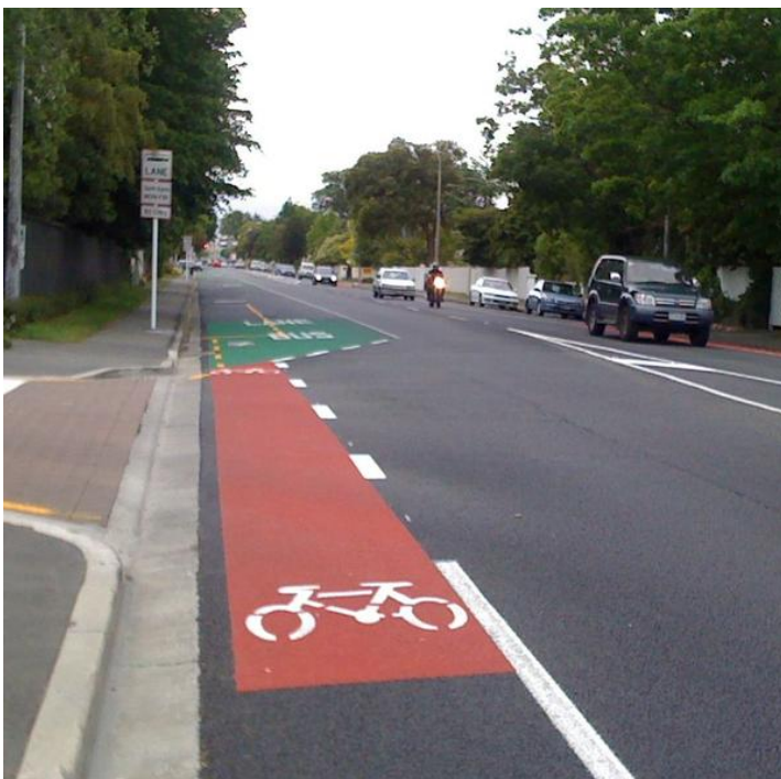
Figure 4.2 Papanui Road bus and cycle lanes

There was still a significant impact on kerbside parking along the route. Prior to treatment there were 549 individual spaces with a mixture of time-restricted and all-day kerbside parking (Transit New Zealand et al 2007). Creating bus priority lanes required the removal of some of these spaces during the morning and evening commuter peaks. During designated clearway times there are now 308 parking spaces available in the morning and 289 in the evening, a 44% and 47% loss respectively. At all other times there are 434 kerbside parking spaces available, a reduction of 21%.