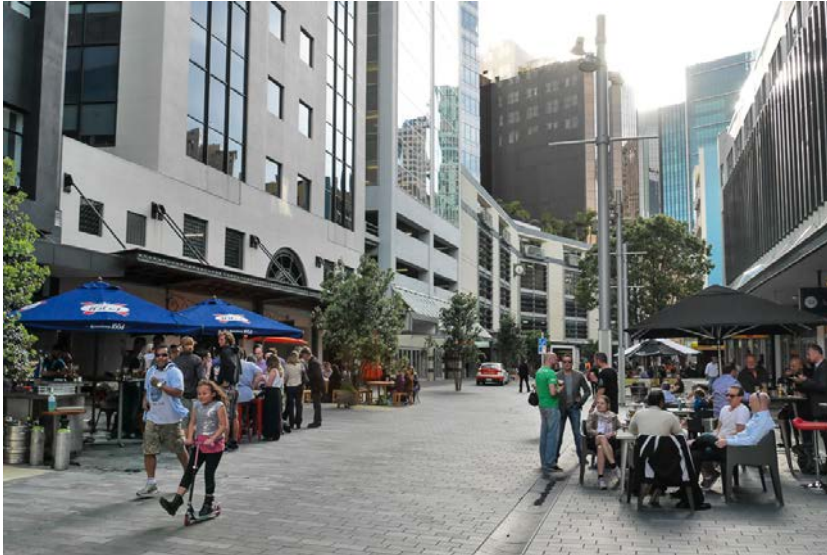
Figure 4.1 Post treatment layout of Fort Street

Fort Street is located in Auckland's central business district. In 2008 a plan for the Fort Street area was announced that would see shared spaces introduced on six streets as part of creating a high-quality, attractive inner city destination. As part of the transformation to a shared space, kerbside parking was completely removed from Fort Street with exceptions for Police vehicles, five-minute loading and deliveries between 6am and 11am (figure 4.1).