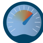
EXCESSIVE SPEED CHANGES