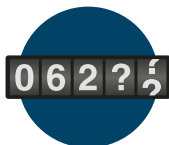
FORGETTING LAST KMS