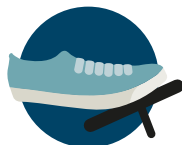
BRAKING TOO LATE