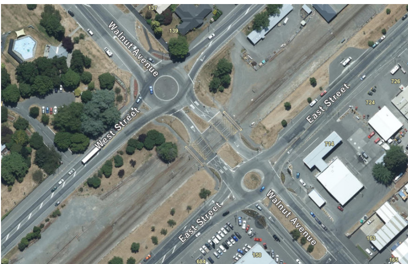
Current view of the intersections