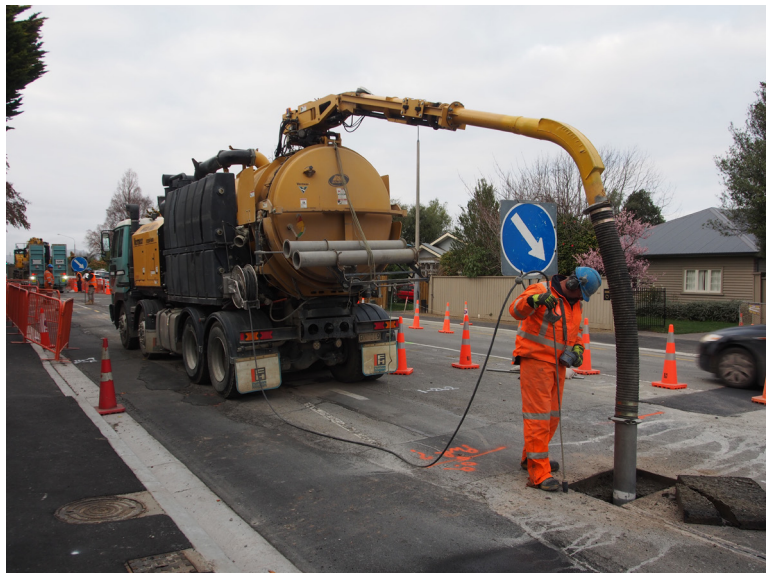
Example of hydro-excavation

The work will be carried out by Fulton Hogan and measures will be in place to minimise noise, dust and vibration levels.