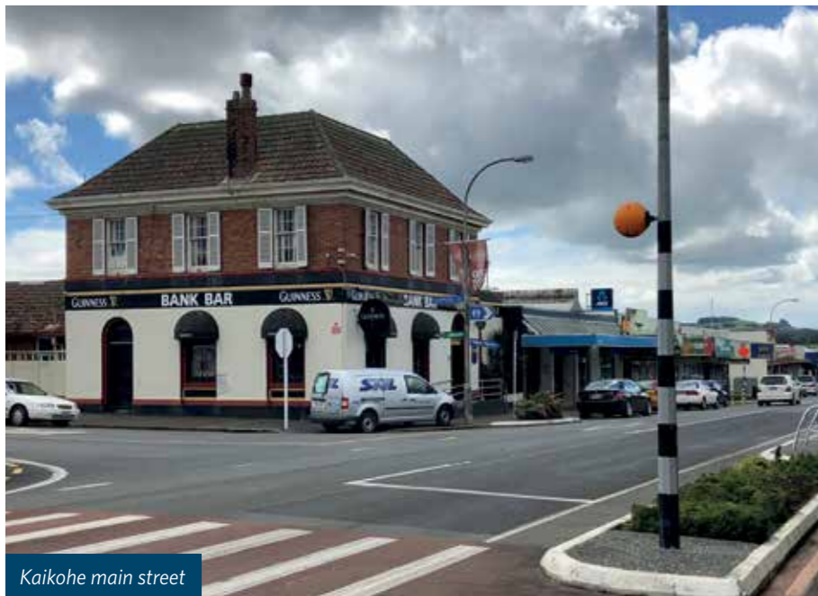
Kaikohe main street