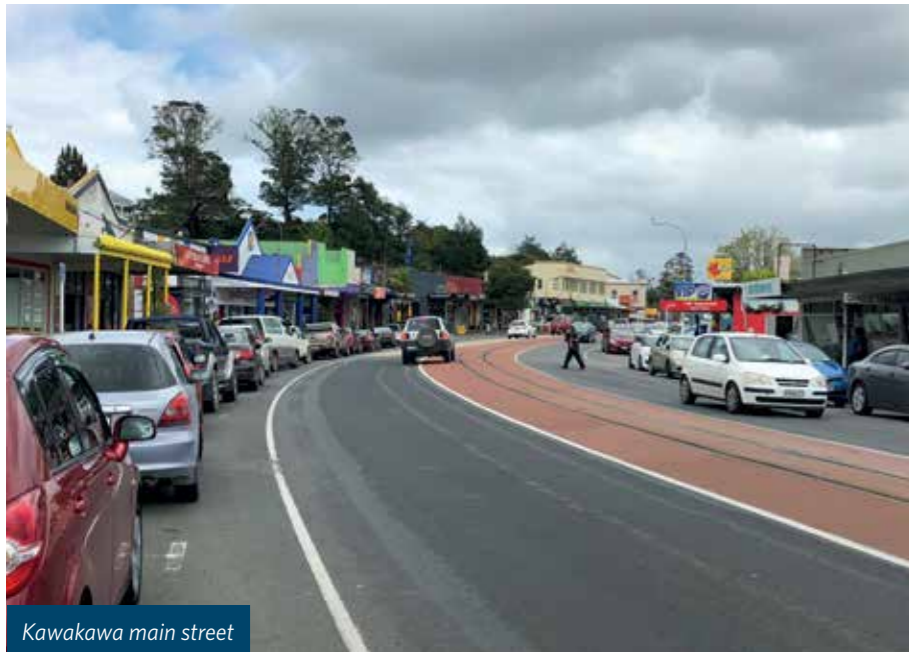
Kawakawa main street