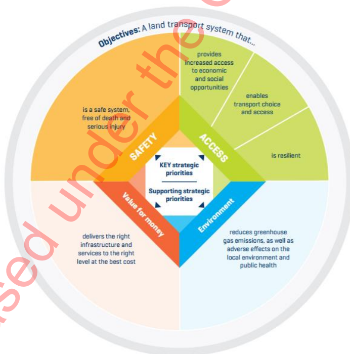
Figure 2: GPS 2018–2021 Strategic Direction

Each strategic priority has associated objectives and long-term results (for a 10-year period). Figure 1 from GPS 2018 below outlines how the strategic priorities and objectives work together.