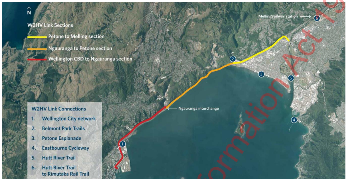
Figure 1: W2HV Link Sections