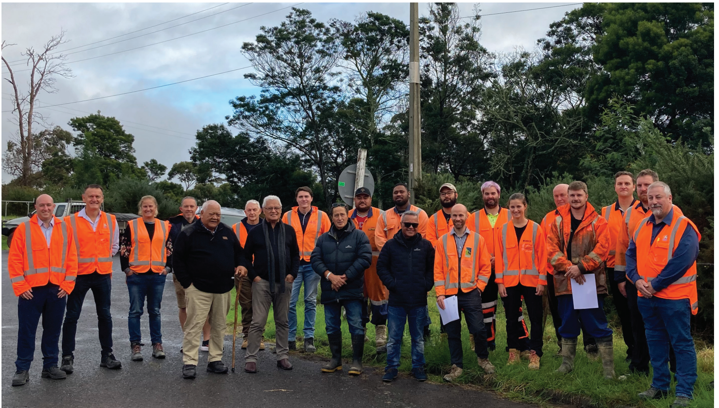
Geotech investigations kicked off with a blessing at Harrison Road, Bethlehem this month.

They will be arranged and supervised by contractors Fulton Hogan and HEB Joint Venture, on behalf of Waka Kotahi NZ Transport Agency. While site investigation activities do generate some noise, we will minimise disruption where possible.