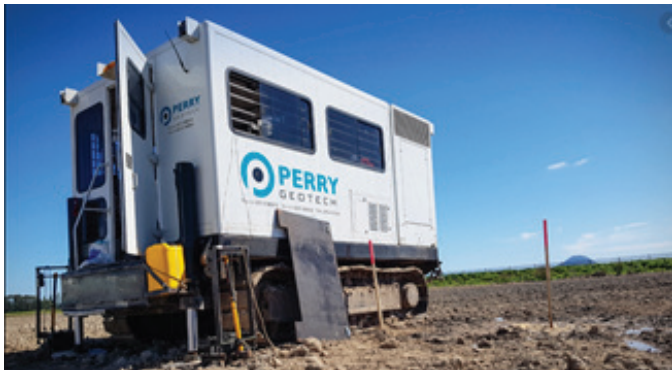
A CPT rig is about the size of a small truck.