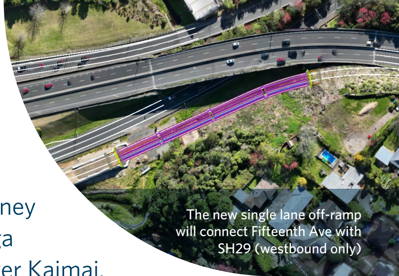
The new single lane off-ramp will connect Fifteenth Ave with SH29 (westbound only)

A new connection from Fifteenth Ave to Takitimu Drive Toll Road/State Highway 29 will be built as part of the Takitimu North Link project – providing a better-connected journey for people travelling from Tauranga towards Te Puna, Tauriko and Lower Kaimai.