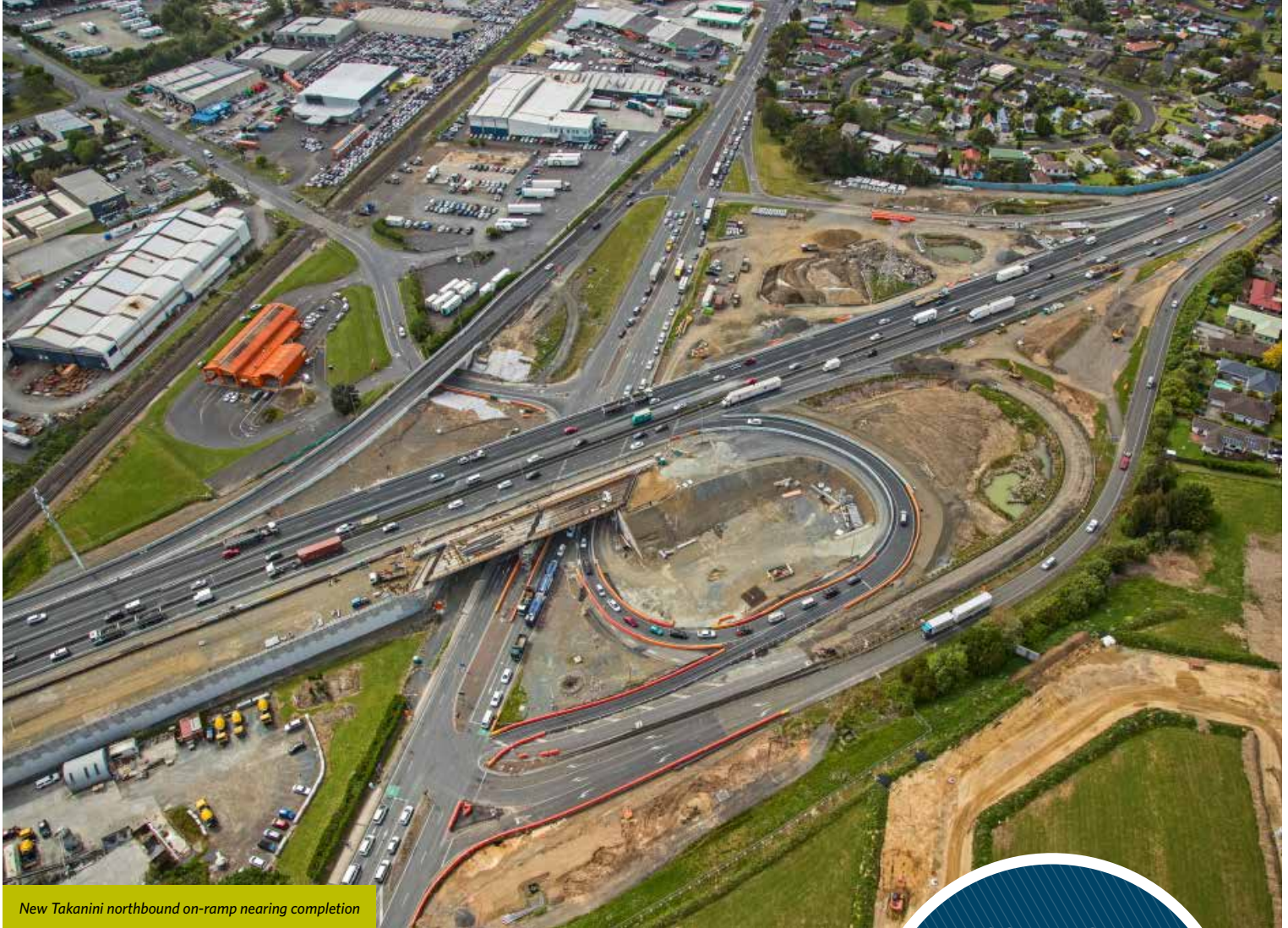
New Takanini northbound on-ramp nearing completion

The new and improved Takanini Interchange will reduce known safety risks, improve traffic flow and provide a more reliable trip for commuters.