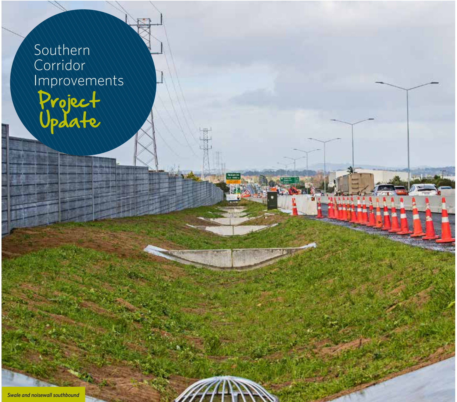
Swale and noisewall southbound