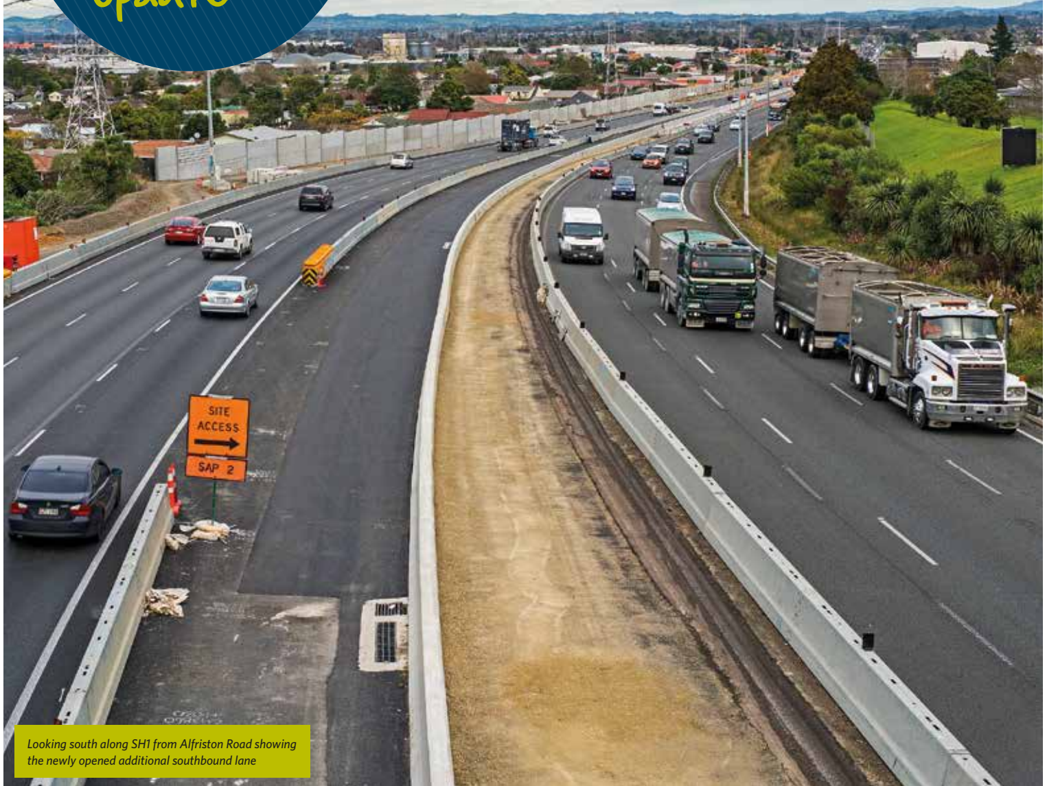
Looking south along SH1 from Alfriston Road showing the newly opened additional southbound lane

You'll also get a sneak peek at what's coming up in areas around the Orams Road Bridge, Pahurehure Bridge and Pescara Point.