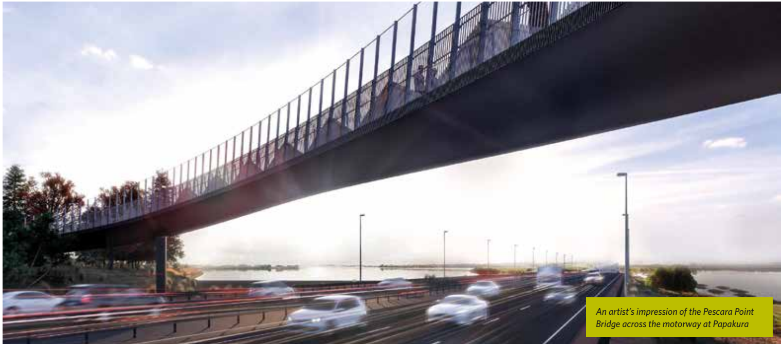
An artist's impression of the Pescara Point Bridge across the motorway at Papakura