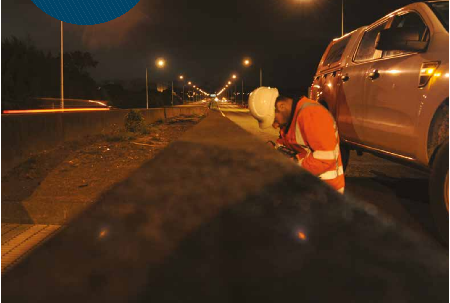
Much of the work has been done at night, such as locating reinforcing in existing structures, as shown here. Soon, much more activity will be noticeable during the day.