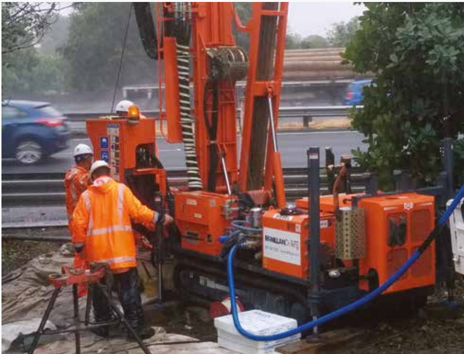
Geotechnical testing near Puhinui Stream to learn more about ground conditions.

In February, work started on the motorway itself. The existing shoulder was widened and a new temporary guard rail installed to create safe working areas for us beside the motorway.