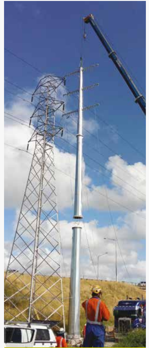
Installation of the new Transpower monopole near Takanini Interchange.