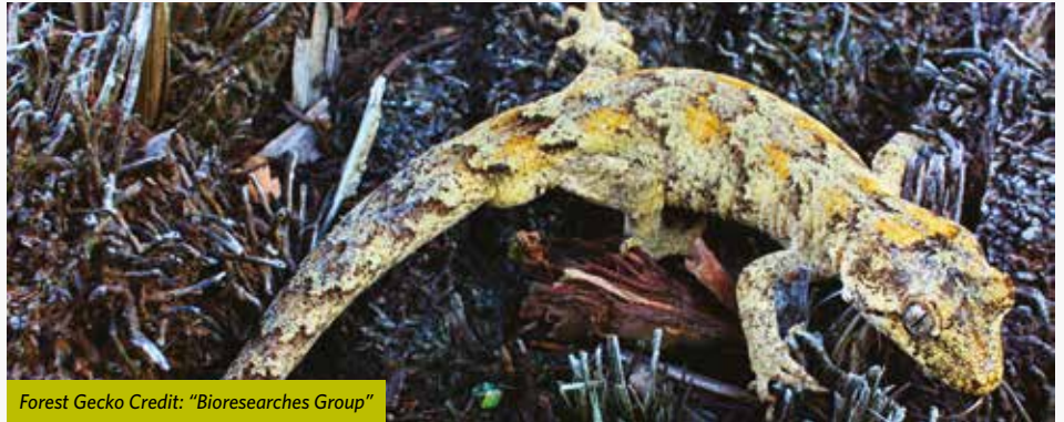
Forest Gecko

We can only trap lizards in the warmer months when they are more active. We will keep you updated on what we find!