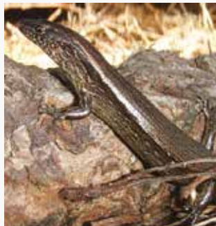
Copper Skink