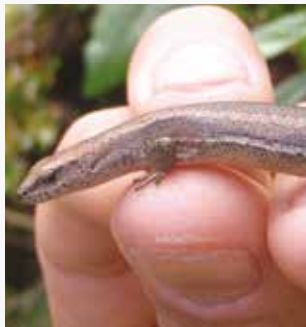
Rainbow (Plague) Skink