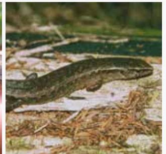
Ornate Skink